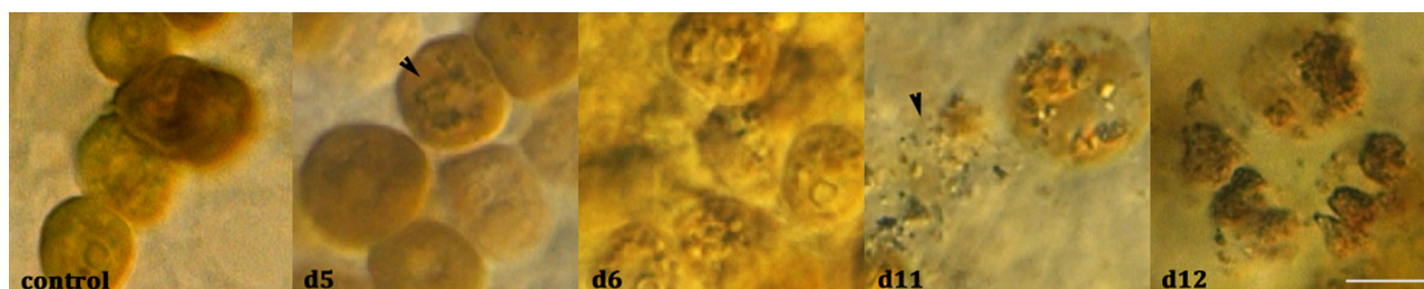
Fig. 3. Symbiodinium morphology in Tridacna maxima course of the experiment. Symbiodinium were observed by light microscopy in samples collected at d0 in control tank and at d5, d6, d11 and d12 in the heat stress experiment tank. Scale bar: 10 µm.