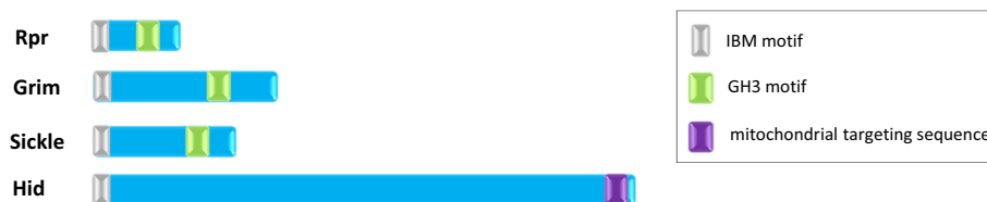
Fig. 1 Link between RHG structure and their mitochondrial localization. In addition to the IBM N-terminal motif (in gray), some members of the RHG family (Rpr, Grim and Sickie) have a helical region called GH3 motif (in green). This motif is required for their

Interestingly, Rpr and Grim localize to mitochondria in a GH3-dependent manner [67–69, 72, 74–76]. Even so, this domain is not a canonical mitochondrial targeting sequence. Freel et al. have shown that the GH3 domain allows Rpr to embed in the outer mitochondrial membrane through interaction of this domain with membrane lipids [74] (Fig. 2). Sandu et al. consider another model in which Hid interaction would be required for Rpr mitochondrial localization [75]. Indeed, as Rpr and Grim, Hid localizes to mitochondria [49, 75]. But unlike the two others, Hid has a mitochondrial targeting sequence in its C-terminal part. Both this sequence and the Cyclin-dependent kinase 7 (Cdk7) protein are required for Hid mitochondrial localization [49, 75, 77]. Hid and Rpr physically interact through the Rpr central helical region which comprises the GH3 domain. Therefore, Rpr would be recruited to the mitochondria thanks to the interaction of its GH3 domain with Hid which possess itself a mitochondrial targeting sequence (Fig. 2).